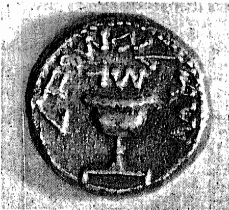
Silver "shekel of Israel" from 68 C.E.