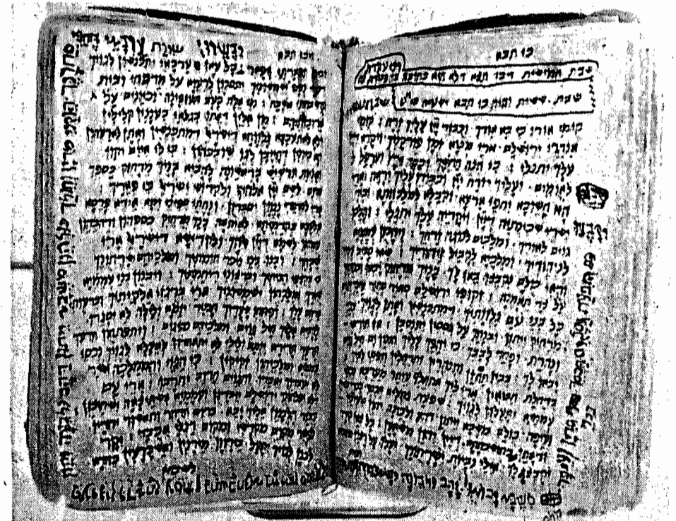
A Yemenite manuscript copied in 1882 contains the prophetic readings for Sabbaths, festivals and holidays, written in Hebrew with interlinear Aramaic translations.